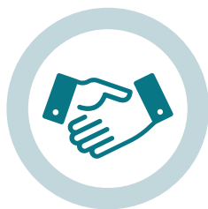
LEVER 1 Values