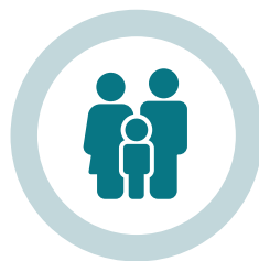
LEVER 4 Family