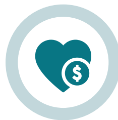
LEVER 5 Action

Some of these concepts may resonate immediately as familiar and relevant, while others may be new or even challenging for you. Over time, the relative importance of different levers may shift as your family grows, you learn and explore, and social issues change.