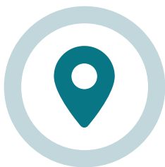
LEVER 3 Place