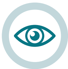
LEVER 2 Intent